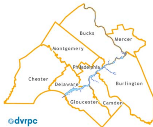
Figure 3: Delaware Valley Regional Planning Commission Region

The Delaware Valley represents more than just part of Pennsylvania and part of New Jersey. This is especially striking for the five Pennsylvania counties; they represent just 5 percent of the state's land area, 32 percent of the population and 28 percent of the crashes (based on 2010 Census and crash data). The four New Jersey counties represent 21 percent of the state's land area, 18 percent of the population, and 17 percent of the crashes. The DVRPC region shares many of the safety priority issues faced by Pennsylvania and New Jersey in general but also has its own unique character and safety concerns. For this reason, DVRPC prepares a regional safety action plan that draws on the work of each state and also informs the states of specific safety needs in the Philadelphia metropolitan area.